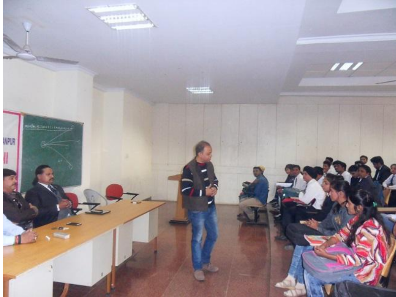
"Workshop on Reinventing Management Scope and Skills " at Institute of Business Management held on 27-09-2017